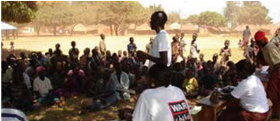
War Child Canada community awareness programme

times more likely to report that police and lawyers are effective in handling cases and 3.5 times more likely to report that perpetrators are being appropriately prosecuted.