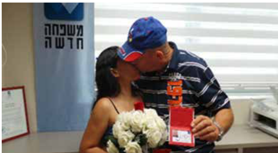
An interfaith couple supported by New Family, Israel

forms of discrimination, from the inability to marry, economic disadvantages, ineligibility for fertility treatments and adoption, to disqualification from purchasing state-owned lands and joining communal settlements and more, according to their religious and family status.